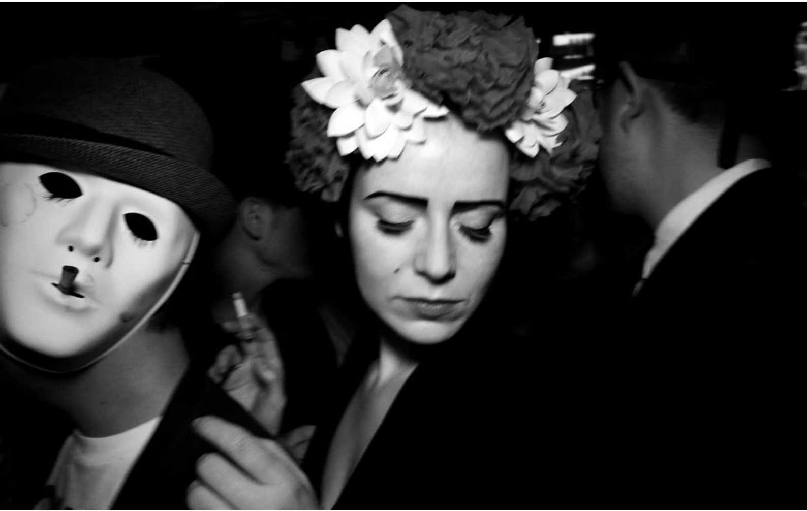
Maskenball, April 2012, © Dorothea Tuch