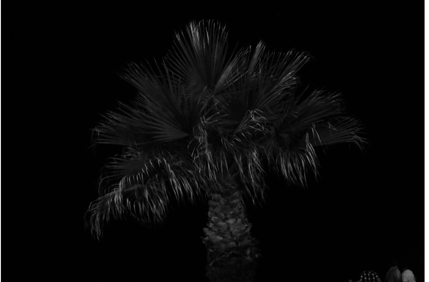
Palme, Mai 2013