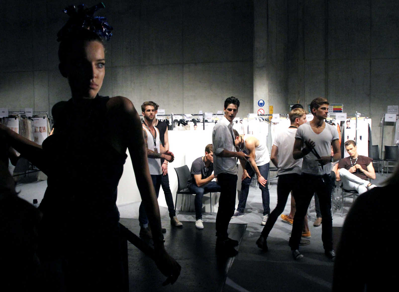
Michalsky StyleNite, Berlin Fashion Week, Juli 2012