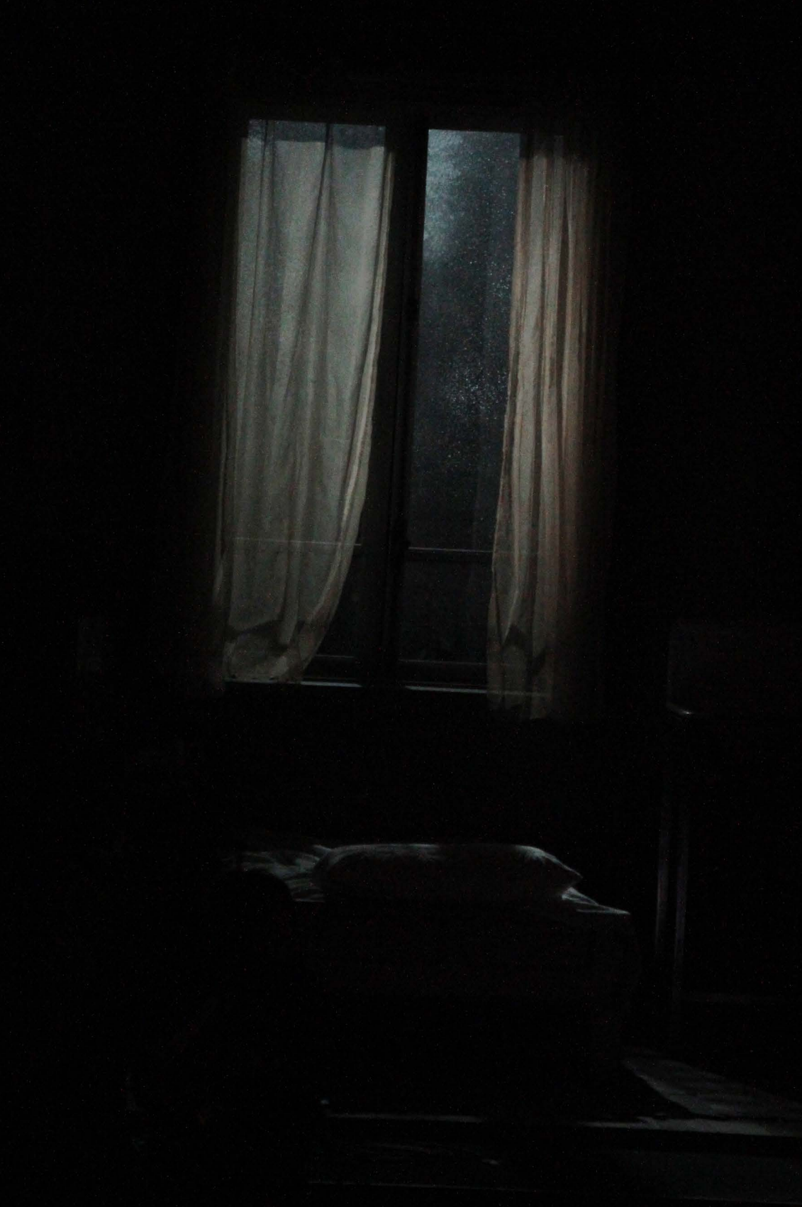
Fenster, Januar 2014