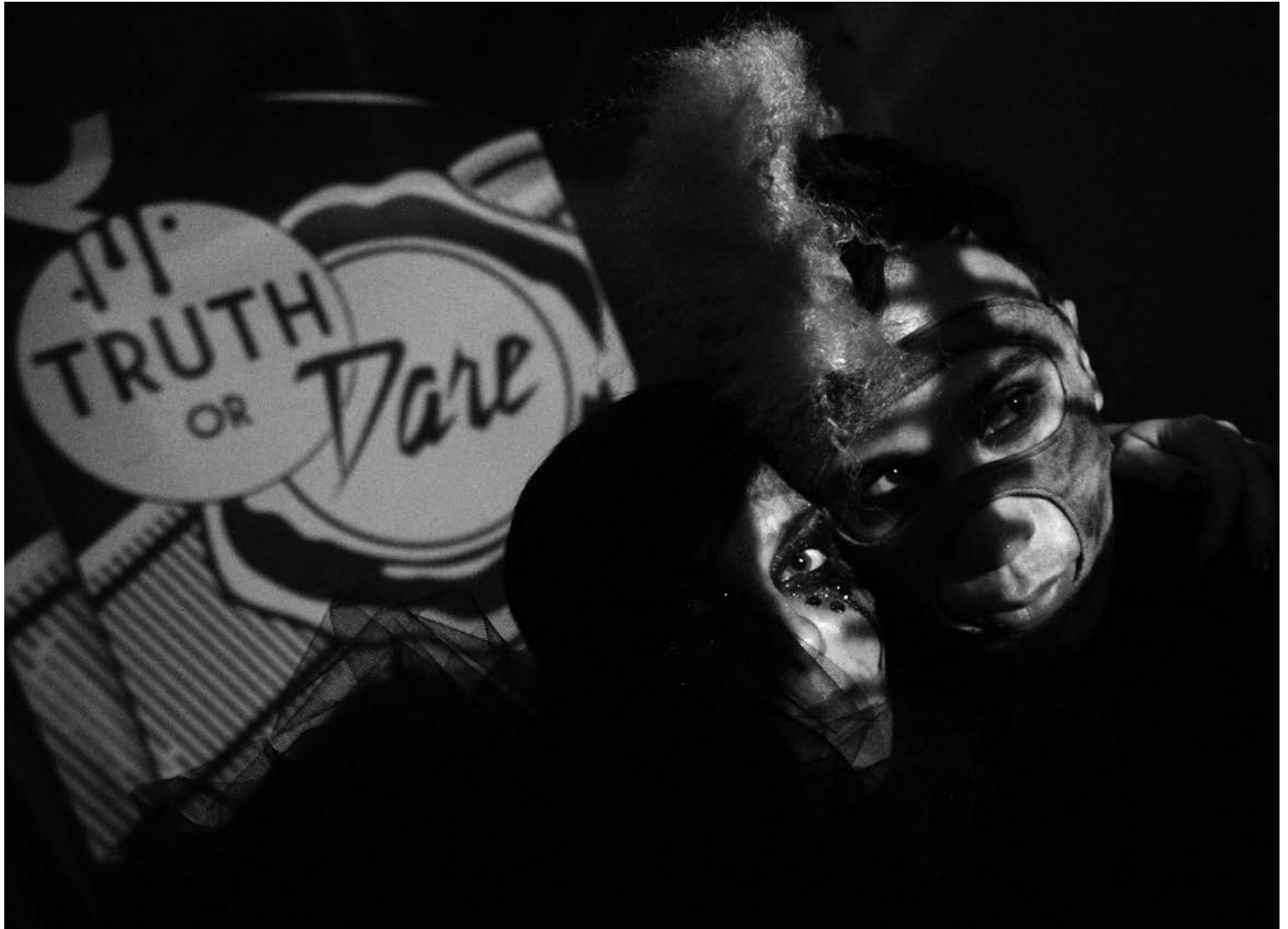
TRUTH OR DARE, MU BERLIN, April 2011