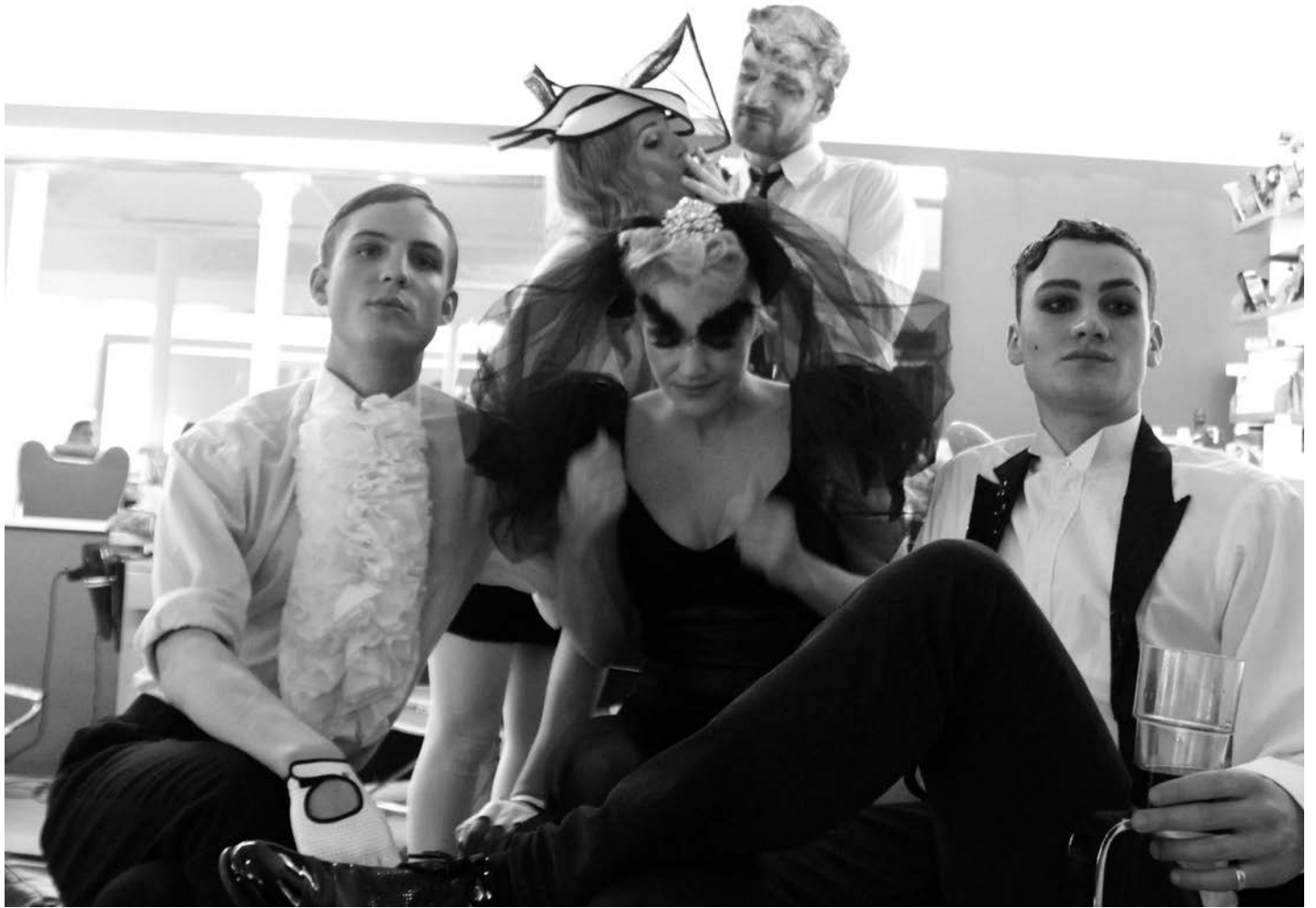
TRUTH OR DARE, MU BERLIN, April 2011