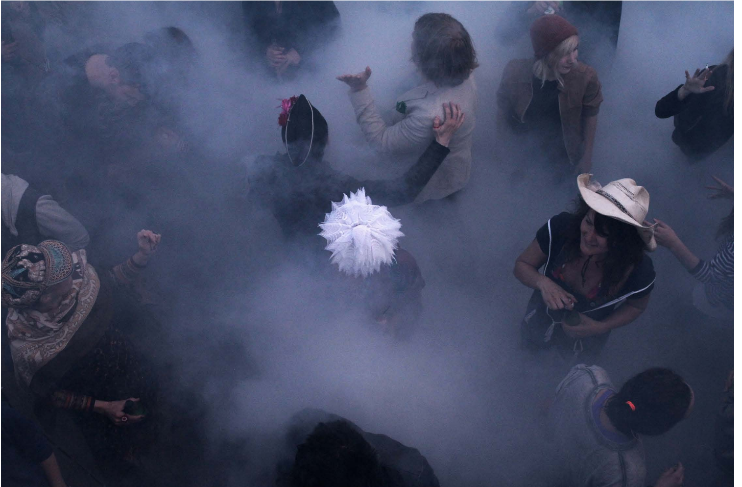
ELSE, Juni 2014, © Dorothea Tuch