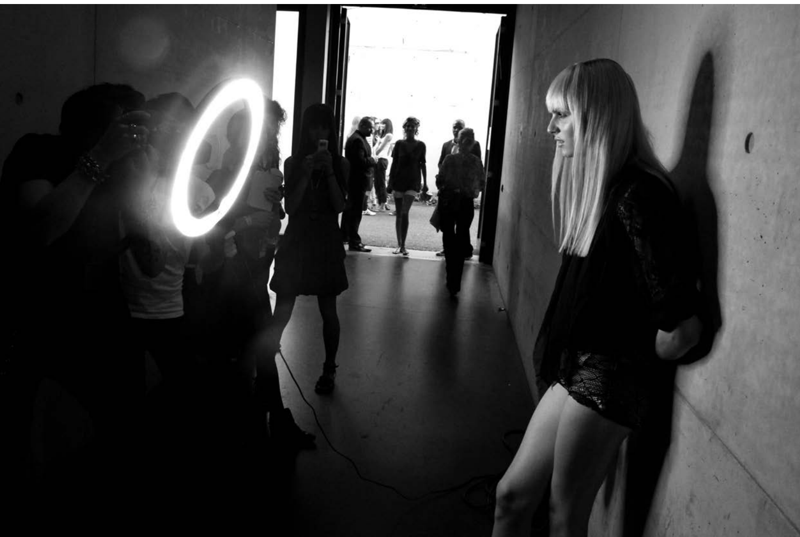
MICHALSKY STYLENITE, Berlin Fashion Week, Juli 2011