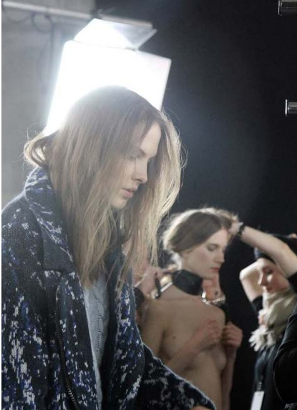
LALA BERLIN, Berlin Fashion Week, Januar 2014