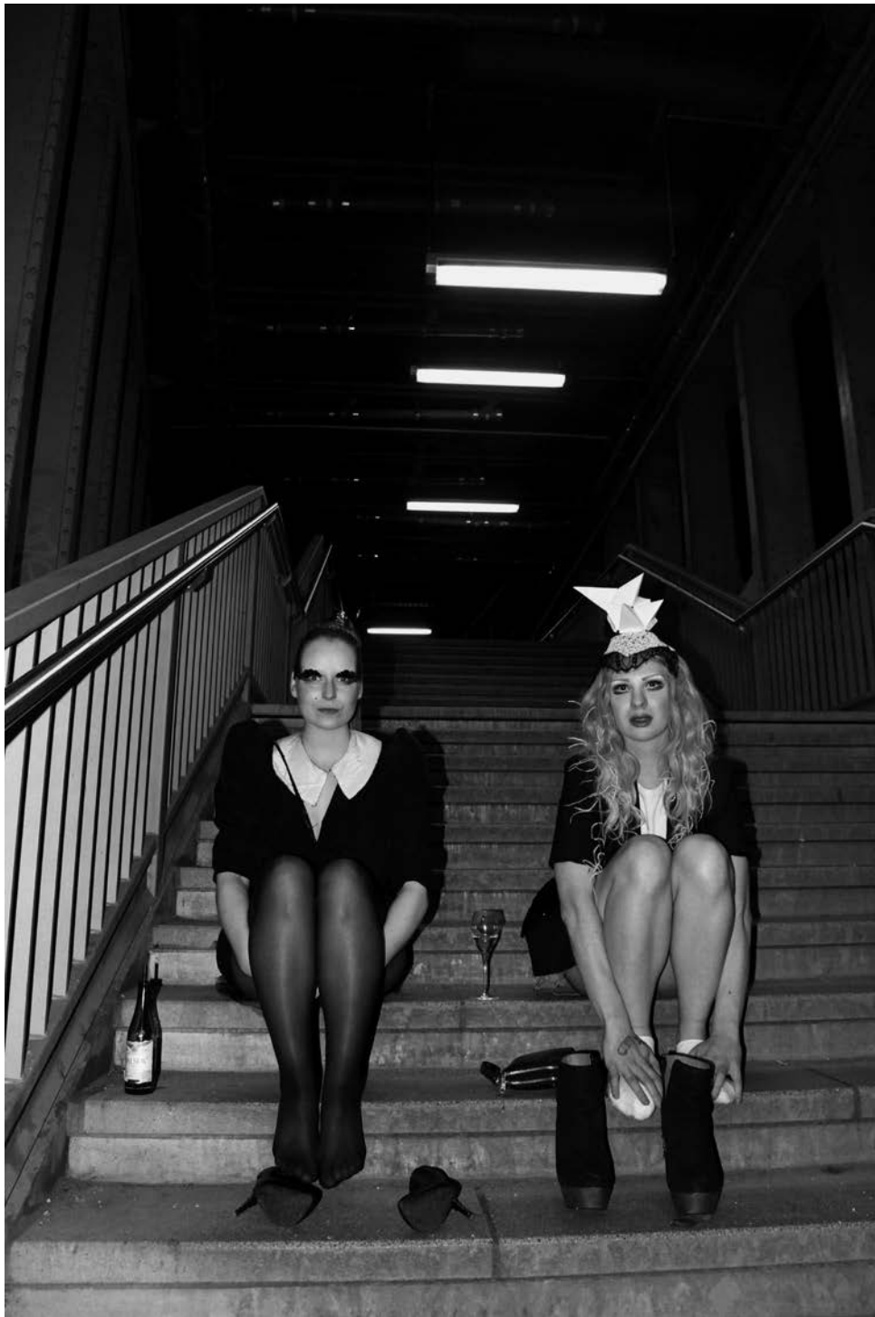
TRUTH OR DARE, MU BERLIN, April 2011