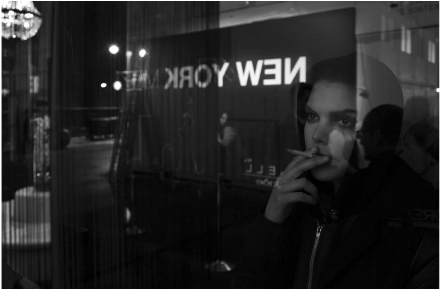
Hinter dem Zelt, Berlin Fashion Week, Januar 2013, © Dorothea Tuch