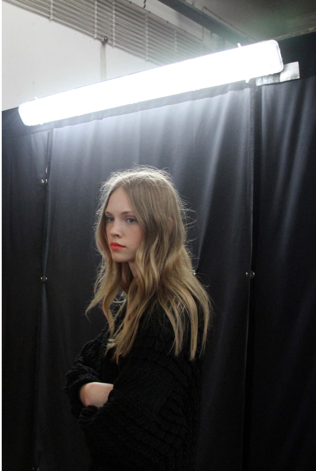
LALA BERLIN, Berlin Fashion Week, Juli 2013, © Dorothea Tuch