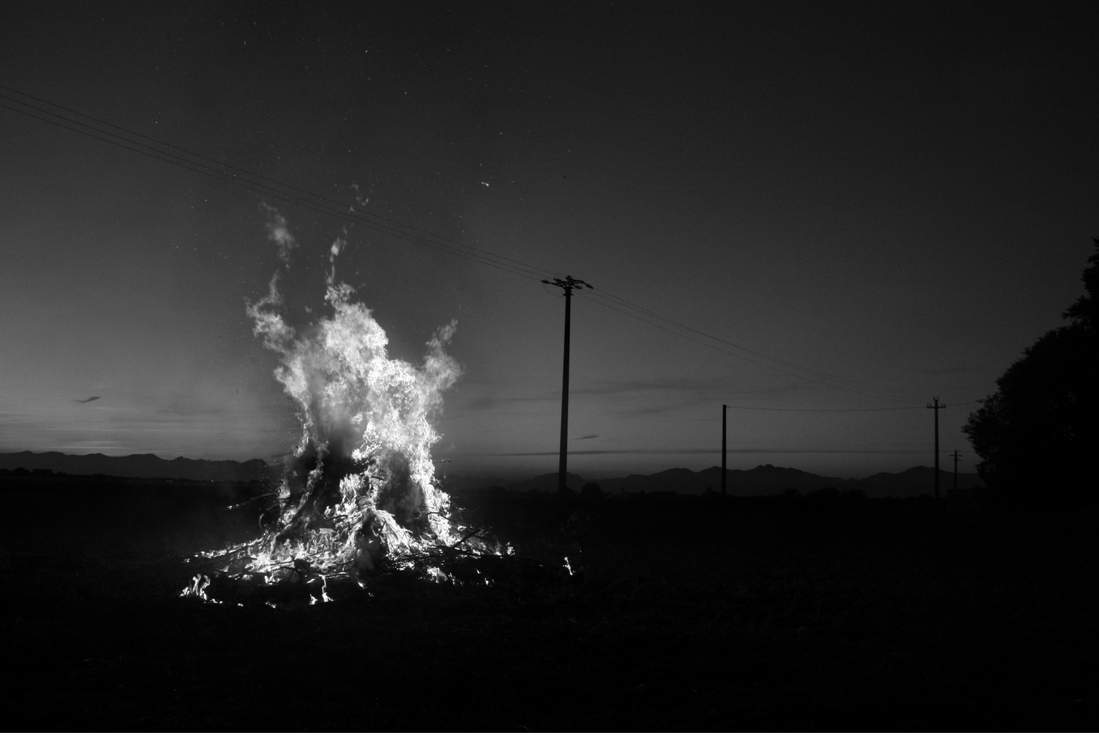
Feuer, April 2012