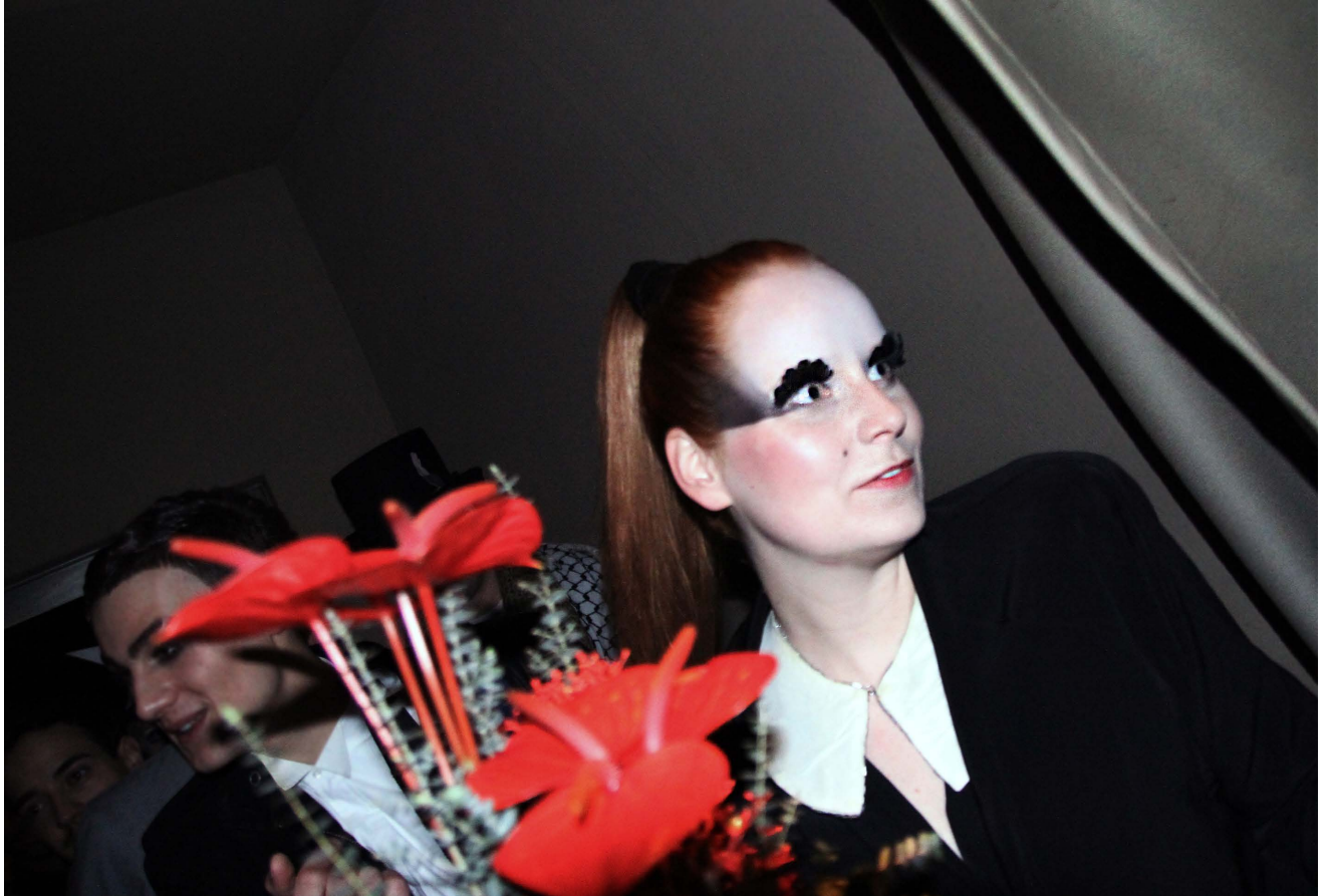
TRUTH OR DARE, MU BERLIN @ Bar Tausend, April 2011