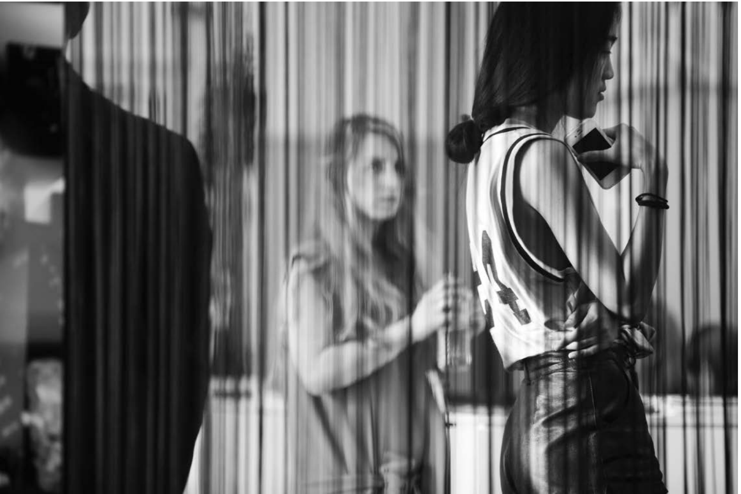
Designer for Tomorrow, Berlin Fashion Week, Juli 2013